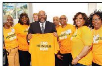
2018 Hunger Summit and Lobby Day May 8-9, 2018 | Springfield, IL